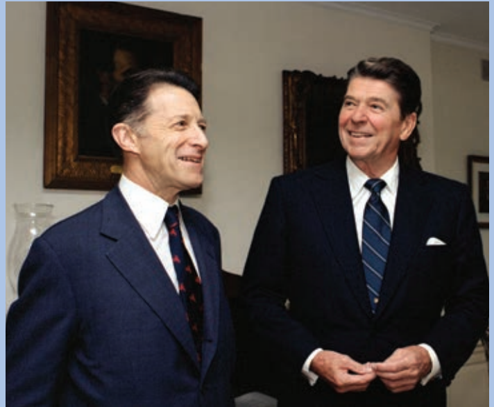
Caspar Weinberger with President Ronald Reagan at the Pentagon.

"The Next War," published in 1998 with an introduction by Lady Margaret Thatcher (another great hero of the Cold War), discussed five possible scenarios for global conflict involving the United States. Along with discussions of geopolitics and military strategy, it included fictionalized accounts of battlefield action that read like something out of a Tom Clancy novel.