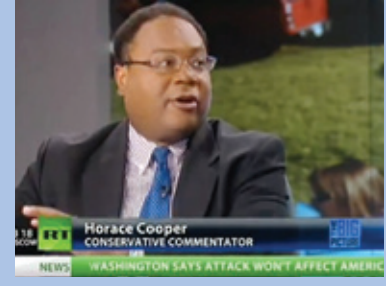
Project 21 Co-Chairman Horace Cooper blames liberal big city mayors' antibusiness policies for diminishing resources for schools on Russia Today.

Their spokesmen are frequently heard in the mainstream media charging that voter ID laws are designed to disenfranchise voters or are motivated by racism, with no mention of their liberal biases.