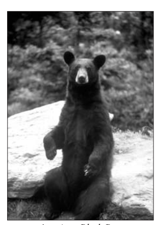
American Black Bear

"No matter what happens, if you shoot a bear, you're in trouble."