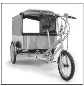
Soft Top Pedicab