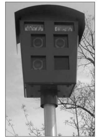
A Washington, D.C. traffic camera