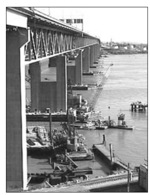
New Benicia-Martinez Bridge (1999)