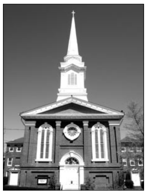
Warrenton Baptist Church in Warrenton, Virginia

Sources: Washington Post (February 22, 2004), Fauquier Citizen, Fauquier Times-Democrat